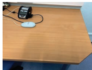
Figure 2: Desk