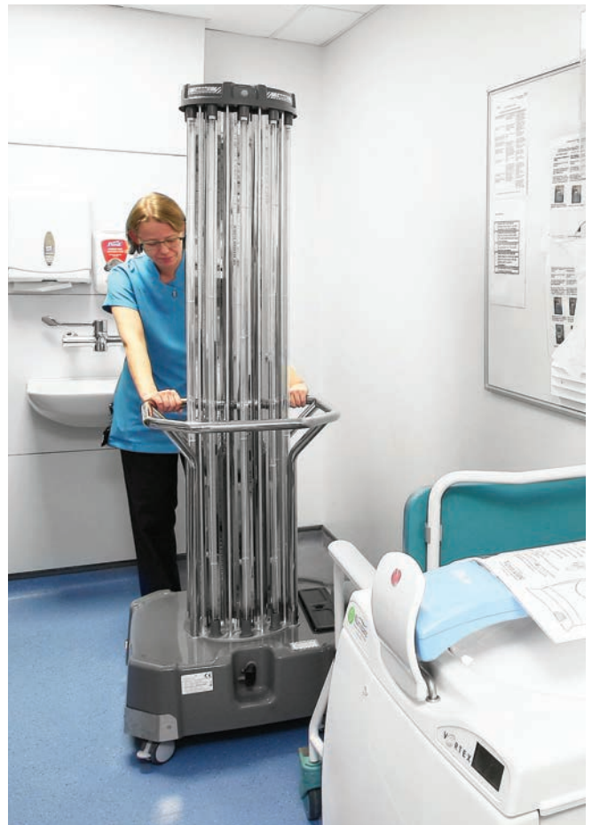
Figure 1: Ultra-V UV-C system