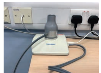
Figure 3: Spirometer

The images above demonstrate automated bio-decontamination system Ultra-V UV-C (Figure 1) and touching surfaces used for sampling (Figure 2 and 3)