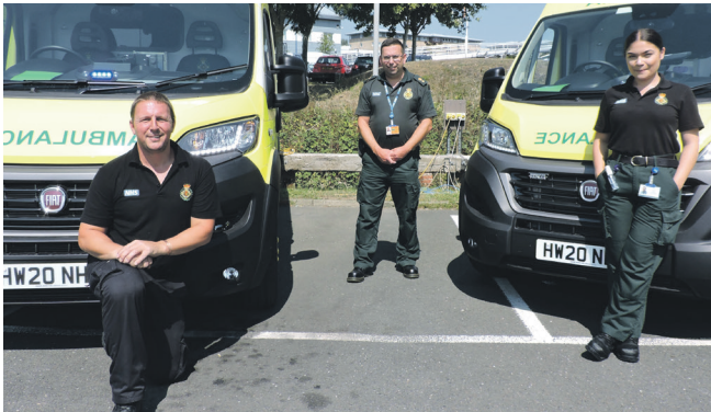
Isle of Wight NHS Trust ambulance team

"Our ultraviolet-C and hydrogen peroxide vapour technologies are already used by more than half of NHS Trusts; however, we believe that clinical decontamination technology will soon become the norm in clinical services of all kinds as forward-thinking trusts like Isle of Wight look to secure best-in-class technology to ensure the continued health and wellbeing of their patients during this pandemic."